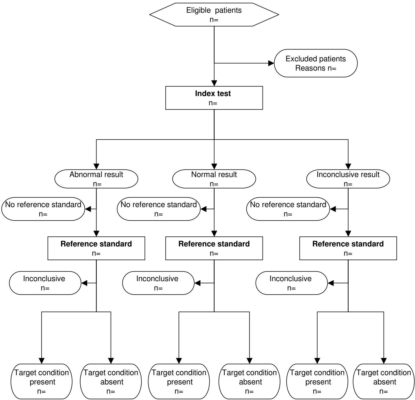
Prototypical flow diagram of a study of diagnostic accuracy. First official version, January 2003.